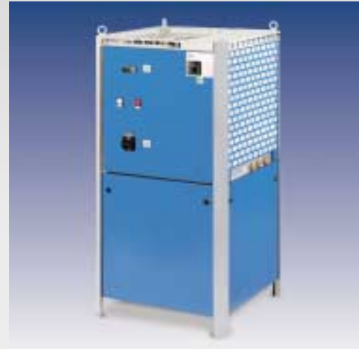
VWK/1 - Water chiller with a cooling capacity of 2 to 15 kW, with tank and pump. Compact design with high temperature accuracy.