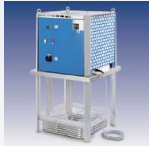
TRK - Immersion chiller for cooling lubricants with a cooling capacity of 2 to 75 kW. Service-friendly in maintenance and cleaning.

In addition to our standard product range, we offer you solutions for liquid cooling in all industrial applications.