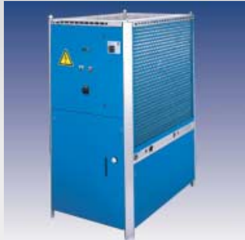
SVK - Water chiller with a cooling capacity of 15 to 70 kW, with tank and pump. Compact design with high temperature accuracy.