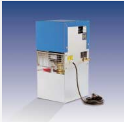
LWK - Air-type water recoler without refrigeration system with a cooling capacity of 2 to 2.5 kW, with tank and pump. The low-cost alternative for applications with higher water operating temperatures.